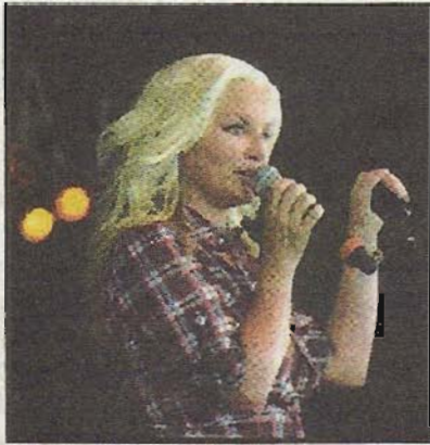
From backyard Bar-B-Q's to festivals to back stage with Edwin McCain