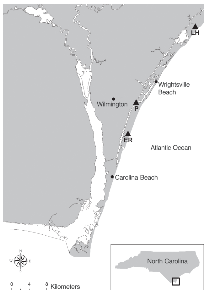
FIGURE 1. Sites of winter sampling of sparrows in coastal North Carolina: Lea-Hutaff (LH), 34^{\circ} 19' 46'' N, 77^{\circ} 41' 31'' W; Parnell (P), 34^{\circ} 11' 05'' N, 77^{\circ} 50' 18'' W; Estuarine Reserve (ER), 34^{\circ} 08' 17'' N, 77^{\circ} 50' 49'' W.

weather permitting. We divided each year of sampling into discrete blocks by month because of this relationship to the tide and to ensure that data from each of our three sites were included in each sampling block.