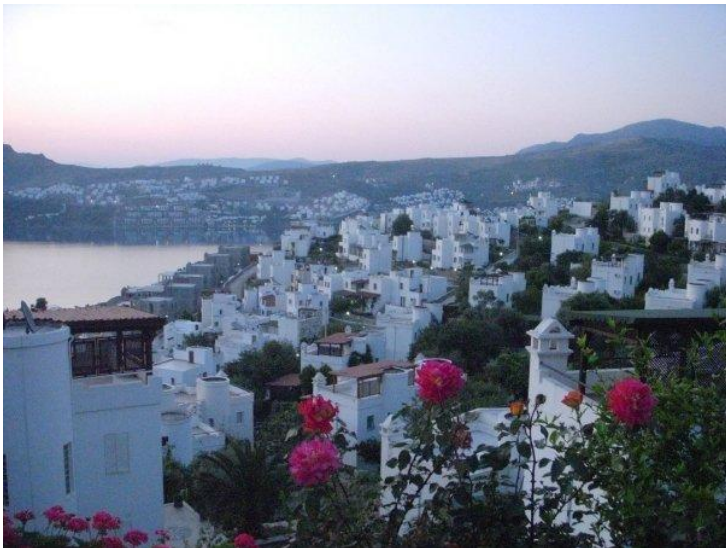
Holidaying along Turkey's Mediterranean Coast

I found that I learned so much about myself while studying abroad. You gain a confidence in yourself that you would not have earned staying in the States. When you venture to a new place and experience new things each and every day you learn so much about yourself and are always surprising yourself with the things you never thought you could do.