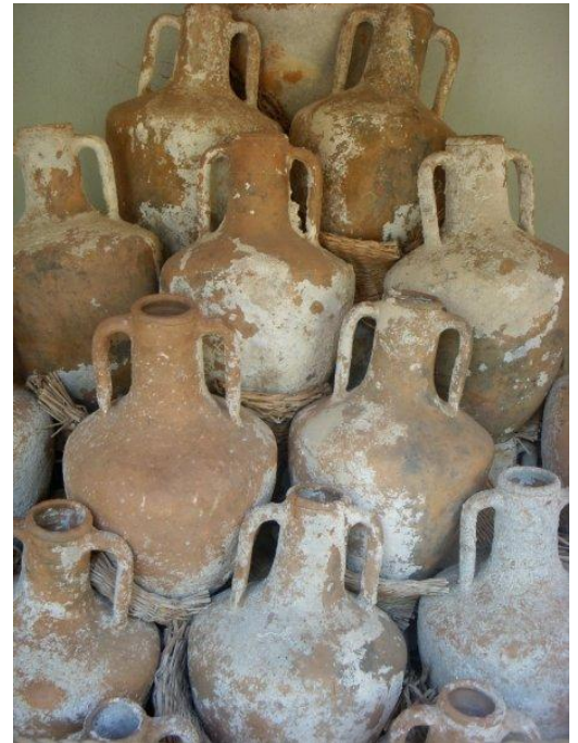
Jars, Turkey's Mediterranean Coast

As a political science student we claim to study the world, but how can we do that if we do not go out and study it during that process? Studying abroad is essential in the process of understanding the world we live in. Perspective is one of the most important things we can learn for ourselves and studying abroad is an excellent way to get that.