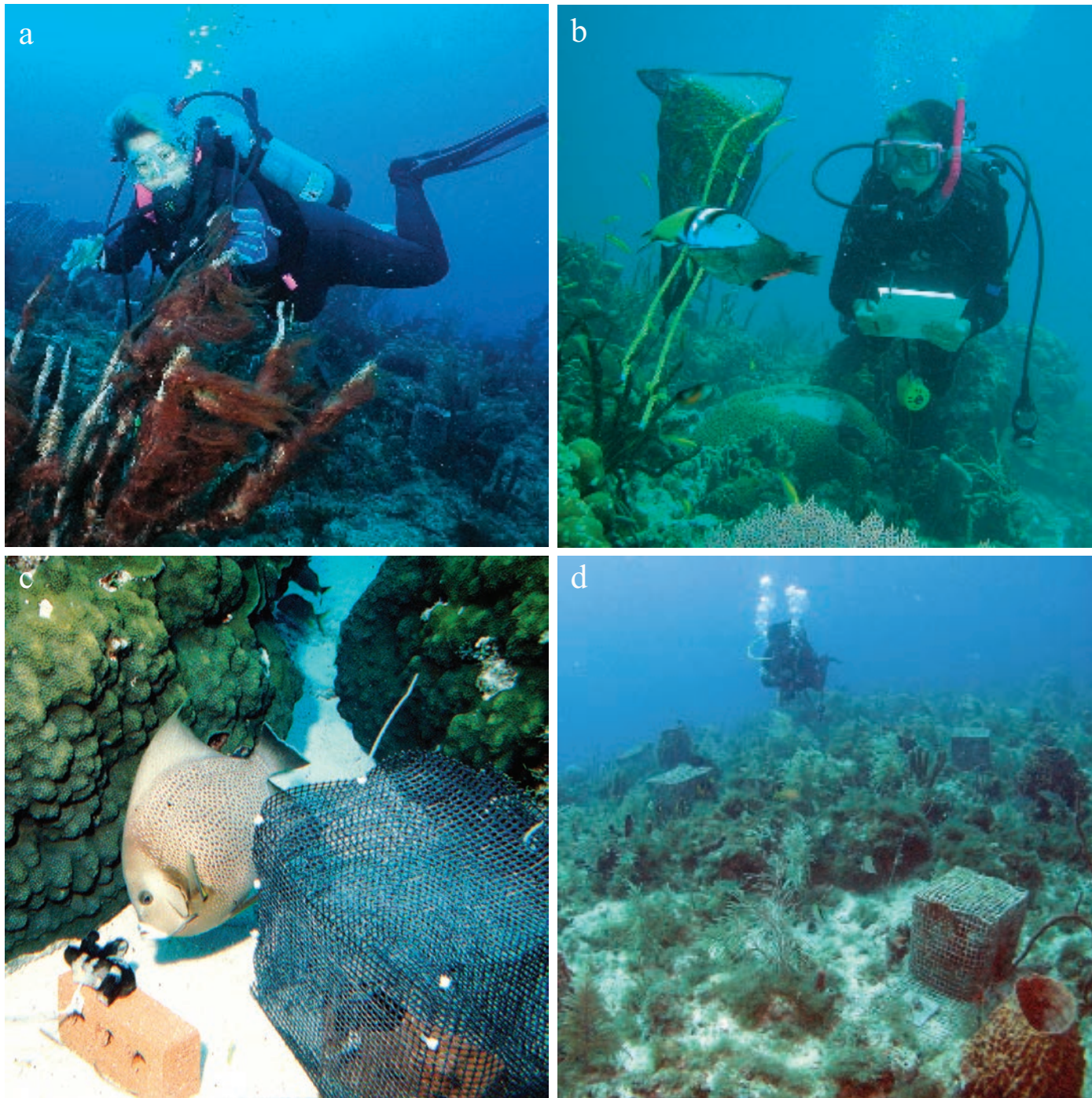
FIGURE 1. Photographs illustrating various field methods that use scuba diving for studies of marine chemical ecology in the Caribbean. (a) A diver examines and prepares to collect marine cyanobacteria, Lyngbya spp., that are overgrowing a gorgonian (photo by Karen Lane Schroeder); (b) A diver observes fishes feeding during an underwater feeding assay. Paired feeding assays are commonly used to test the palatability of algal extracts and natural products. Artificial food made with palatable algae is attached to polypropylene lines, with one line containing control food cubes and one containing food with extracts or pure compounds at their natural concentrations (photo by R. Ritson-Williams); (c) Gray angelfish, Pomacanthus arcuatus , feeds on the palatable sponge Chondrosia collectrix attached to a brick. Angelfishes are major consumers of some species of Caribbean sponges (photo by J. Pawlik); (d) Predator exclusion (“caging”) experiment set-up on Conch Reef, Florida. In this case, replicate sponge pieces are placed inside and outside of cages to observe net differences in growth after one year for species that are protected by chemical defenses and those that are not (photo by J. Pawlik).