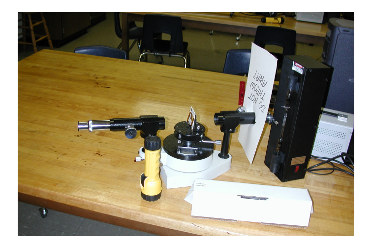
Figure 1: Experimental setup. In the foreground is a flashlight, behind which is the spectrometer. To the right of the spectrometer is the power supply with the helium discharge tube mounted across its high voltage connectors.

The purpose of this experiment is to identify specific wavelengths in the helium spectrum, to determine their precise values, and to compare them to accepted values.