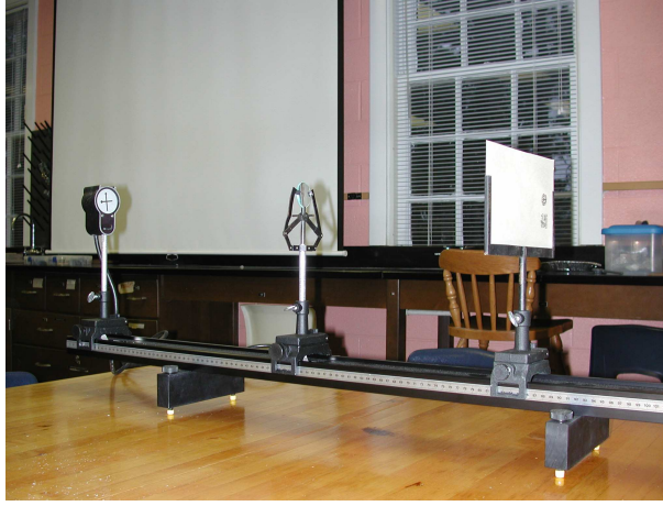
Figure 2: The optical bench. From left to right is the object, which consists of a light source and template, the converging lens, and a screen on which the image is projected.

lens at the object. Move the screen to the location where a well defined image is formed. Record the image distance in Table 1.