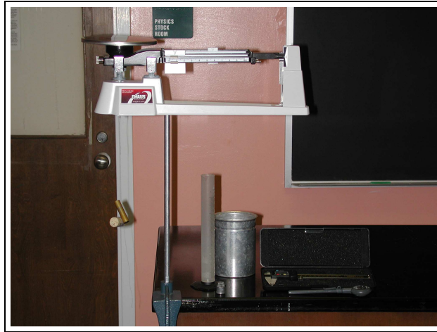
Figure 2: Equipment used in measuring density