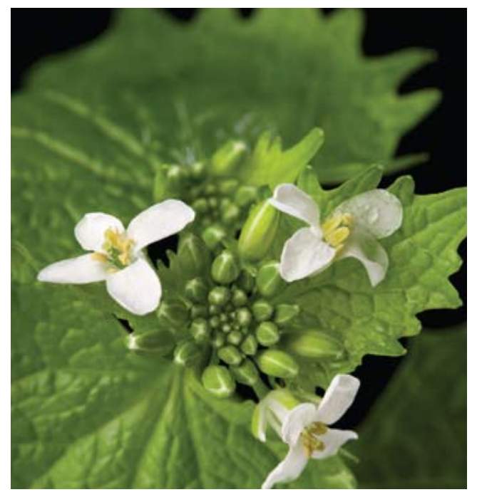
Garlic mustard, an invasive plant species commonly found in the United States.

After learning about the impact of invasive plant species, students often want to know how they can make a positive contribution. Invasive plant species monitoring is an important service students can provide to local, state, and