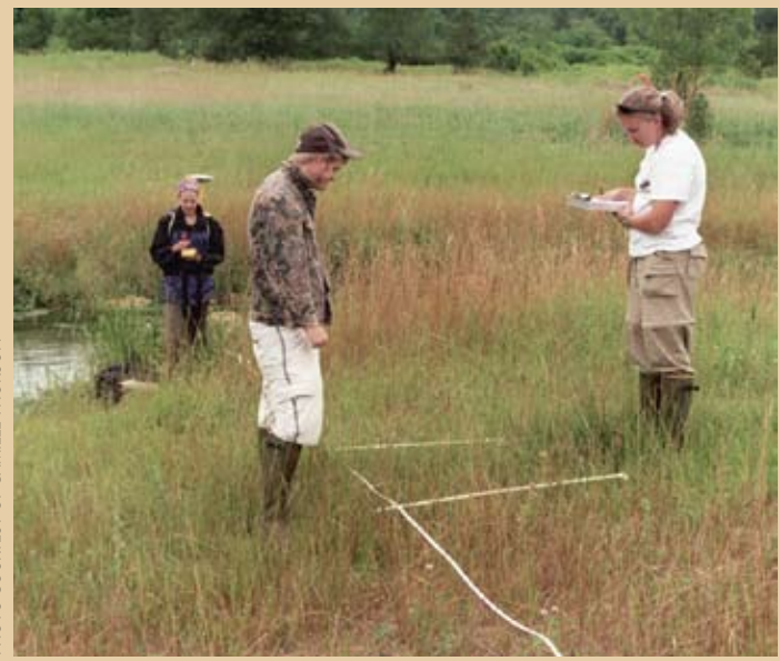
Students use transect lines to monitor invasive plants.

Teachers who have used the lessons report that students enjoy the variety of activities available throughout the curriculum and seem excited about working on the invasive plant species removal project. In addition, teachers note that students tend to work hard on the projects, since they think their actions are having an immediate positive impact on their communities.