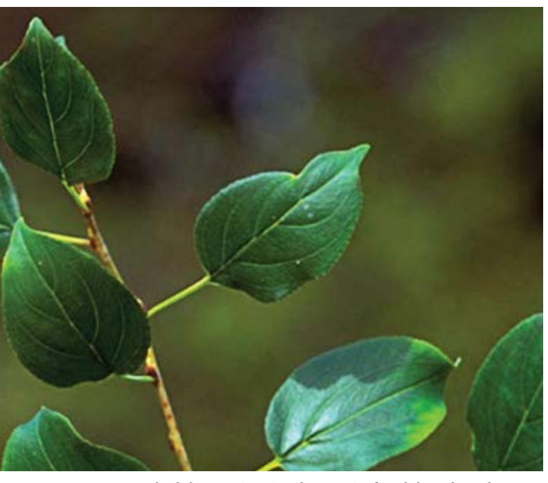
Common buckthorn, an invasive plant species found throughout the United States.

The development of the IPS Education Guide was a unique collaboration of UW–Stout students and faculty, along with a local high school science teacher. The curriculum provides an opportunity for high school students to learn more about ecology, botany, invasive plant species, and the use of technology in science. Students develop knowledge and understanding of organisms and their interdependence in a local ecosystem. Students then apply this knowledge in a culminating field project to remove invasive plant species at a local restoration site. This activity connects life science concepts to an important social and environmental issue. Through the IPS Education Guide, students are able to see how an