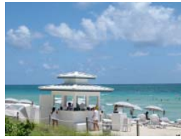
Travel Guide: Where Do You Want To Go?