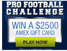
Test Your Football Skills