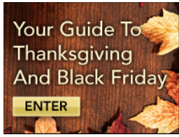
Fall Fun: Your Guide To Thanksgiving & Black Friday