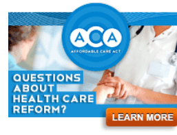
Affordable Care Act