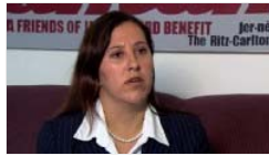
My Dinner With Herman Cain http://abcnews.go.com/Blotter/video/dinner-herman-cain-14910774