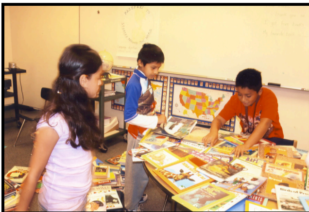
Mary C. Williams Elementary School students choose books to take home.